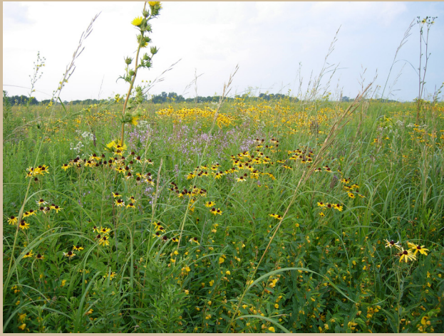
U.S. Forest Preserve