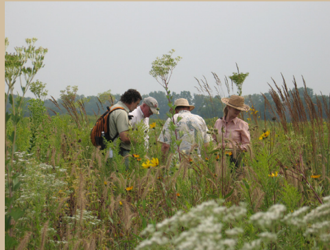
U.S. Forest Preserve

Midwin (mid-AY-win) meets the Centennial Green Legacy goal of preserving regionally significant open space and is finding new ways to make this major anchor for the region's green infrastructure publicly accessible. The Burnham Plan Centennial brought new partners together to help the Forest Service plan interpretive facilities and infrastructure that will enhance access to and appreciation of the reserve including its restored prairie, cultural and industrial history. So now, thanks to the participation of the American Planning Association, the American Society of Landscape Architects, the American Institute of Architects and the Chicago Metropolitan Agency for Planning (CMAP), there are several exciting plans for state-of-the-art visitor facilities, and alternative transportation schemes, to help Midwin realize its potential as the Chicago region's newest national prairie park.